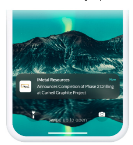
Real-time news release notifications to mobile phone home screens.